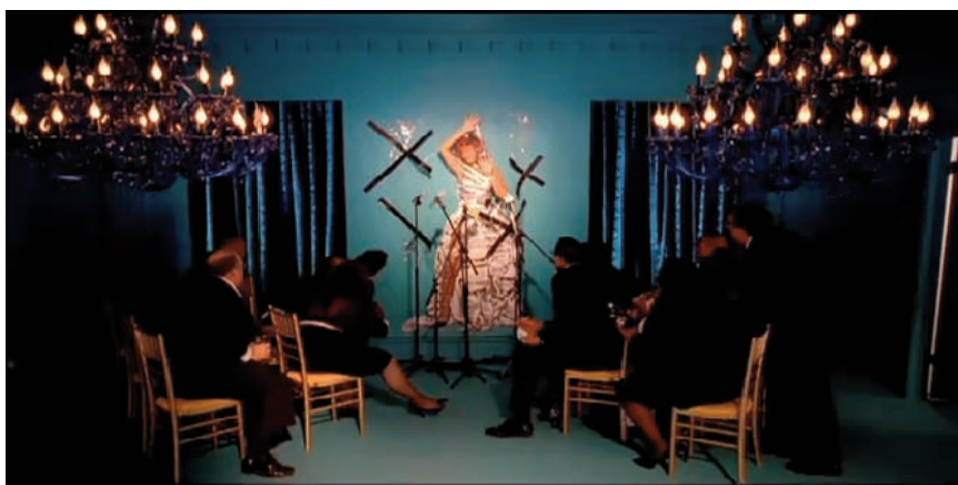
Fig. 3a: “S&M” still

(Deleuze 20). Rihanna is in a multiracial, mixed-gender sex community that is visually juxtaposed against the scenes of her interrogation by the media and public. In another scene, dressed in pink latex—the plastic aesthetic of masochism that “suspend[s] gesture and attitudes”—she performs as both spectator and entertainer of the drama of her own creation (Deleuze 70). Enjoying pink popcorn, she then enters a torture chamber while carrying a whip; the same members of the press who were interrogating her are now bound and gagged. They tremble in anticipation of what she will do to them. But instead, Rihanna merely poses and prances with the whip, what Deleuze calls “[t]he whip or the sword that never strikes” in masochism (70). At one point, she simulates a kiss with a middle-aged black woman who is gagged and bound. Here Rihanna performs the classic masochist, according to Deleuze, in control of the scripts that degrade, define, and ultimately reinforce her power. As the masochist, she educates and conditions the press by preempting their moves and reactions.