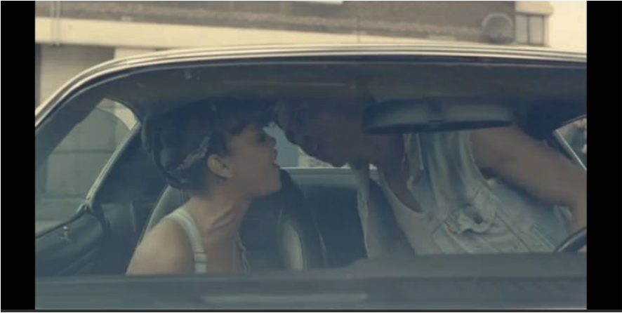
Fig. 4: "We Found Love," video still, © 2011 The Island Def Jam Music Group

Toward the end of the video, Rihanna appears to leave her love as she walks out, until the final frame reveals her huddled in a corner, and shivering. Leaving is a diegetic possibility for her character, but it is not actualized in this fantasy of love as a bad fix.