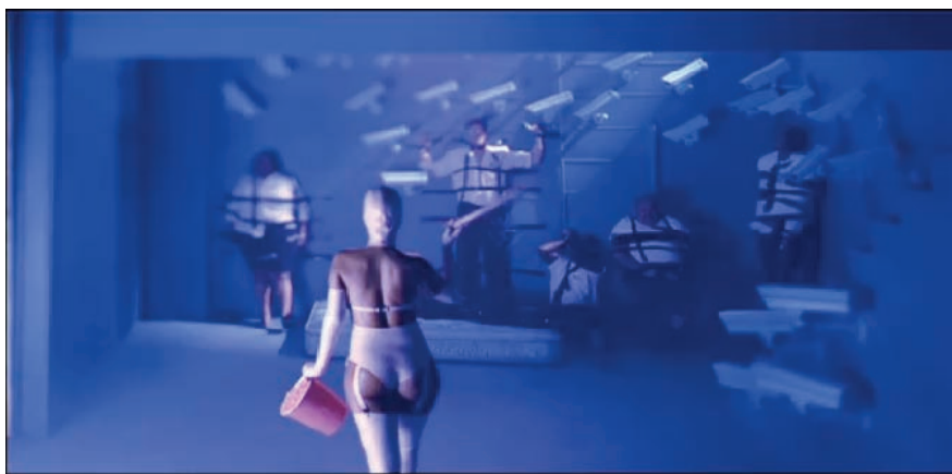
Fig. 3b: “S&M” still