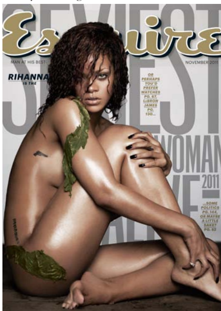
Fig. 1: Cover of Esquire, November 2011 issue, U. S. Edition.

Note: This article was drafted prior to Rihanna and Chris Brown's public reconciliation, though their rekindled romance supports many of the arguments outlined herein.